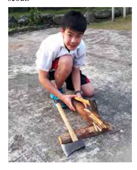
The club also will regularly attend the annual World Scout Jamboree.

The Scouts Club, one of the most practical clubs in the school, is a club filled with joy and challenges. This club focuses on the skills and activities that are required if you want to be a scout.