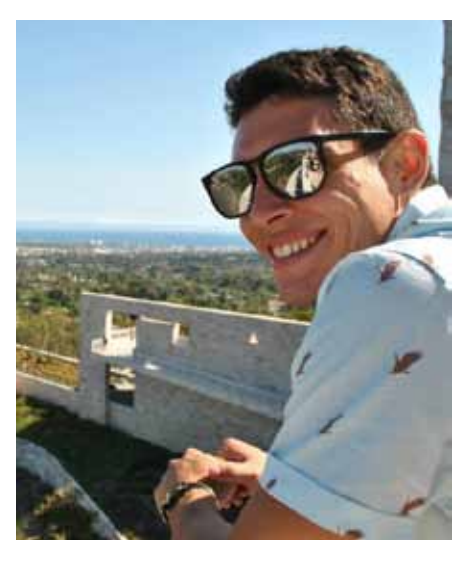
Will you ever publish your novel?

I always love writing, and I like to write about fantasy stuff, like Lord of The Rings. I've been doing that since I was a little kid, so I've always just had a really big imagination and I've always loved Legend of Zelda, Final Fantasy games, that kind of stuff. It's always been something natural to me.