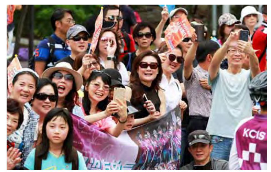
Kang Chiao family and friends cheer for their loved ones.

From grades 7—9, students take part in many activities, from conquering Snow Mountain and swimming across Sun Moon Lake to a central cross-island highway hiking trip. Finally, the last phase of completing this huge dream of exploring is cycling around Taiwan.