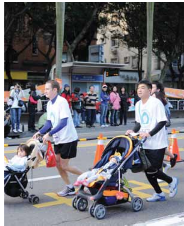
KCBS teachers and students racing towards the finish line.