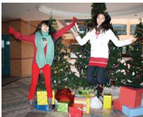
Eighth graders showing their appreciation of the Student Council's efforts

Our future plans are to have sports activities, a high school ball, and sports games with other high schools. The activity department is now focusing on the high school ball. It's going to be hard. All the decorations, food, and student participation need to be organized. We are trying our best to make the students have an enjoyable, memorable high school ball at Kang Chiao Bilingual School."