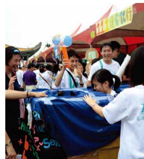
Whack-A-Friend: you have to hit the teachers or students before they duck!

"There were lots of charismatic students. You could feel their effort and passion towards the school event. The