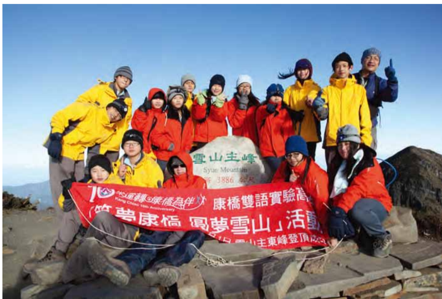
Tired but happy eighth graders smiling on top of Snow Mountain.

"When I was climbing, I felt cold, weak, and tired, but when I got to the top, I felt very happy that I did it. I felt very excited and I couldn't believe that I had made it," said