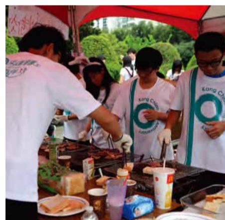
Smoking the meat with real coal.

1101 had a very eccentric stand. They had a game that was very much like Whack-A-Mole. In this game, students and teachers poked their heads out of holes in a big box, and you had to